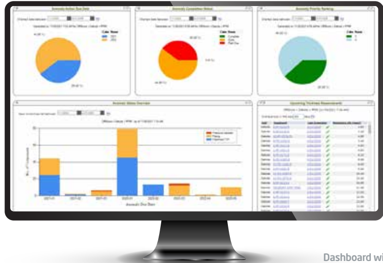
Dashboard with KPIs

Our cutting edge and technologically advanced solutions help companies maintain equipment reliability and safety, determine equipment remaining useful life estimations, and manage inspection data.