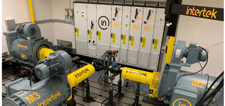
Driveline testing capabilities range from passenger car through heavy-duty vehicle drivelines

The Driveline Department has more than 100 years of combined engineering experience in Driveline performance, durability, efficiency testing and test development.