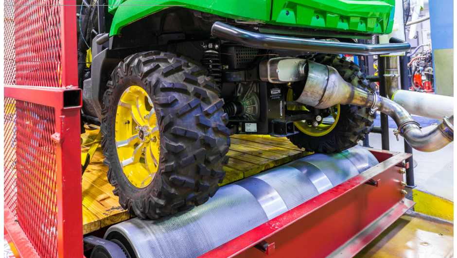
Small engine testing on a chassis dyno