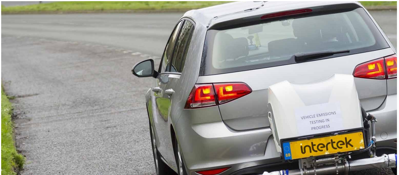
Intertek's PEMS equipment can be mounted internally or externally on any size of vehicle