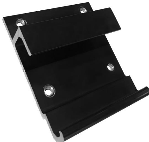
Figure 1 – Panel Clips