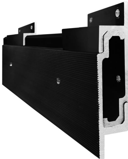
Figure 3 – Panel Clips Engaging Rails