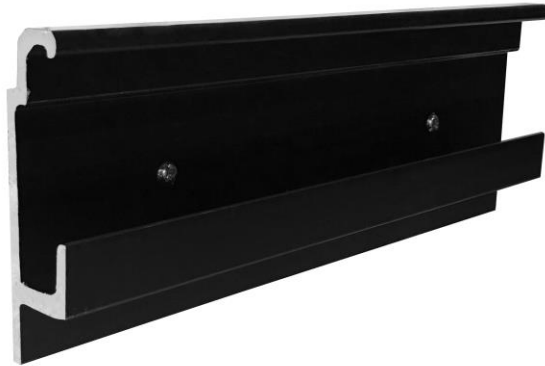
Figure 2 - Rails