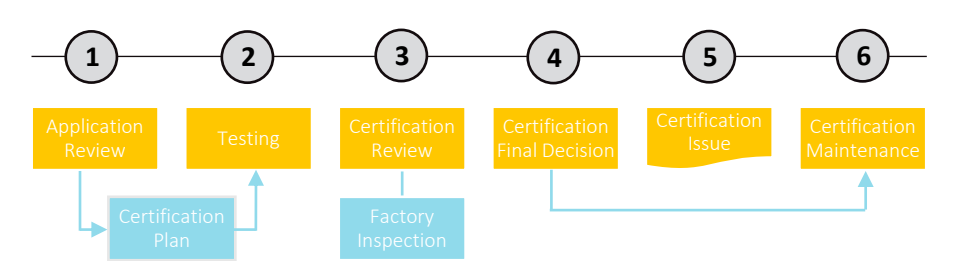
Fig 1.0: Intertek Internal Certification Process Flow – ISO / IEC 17065