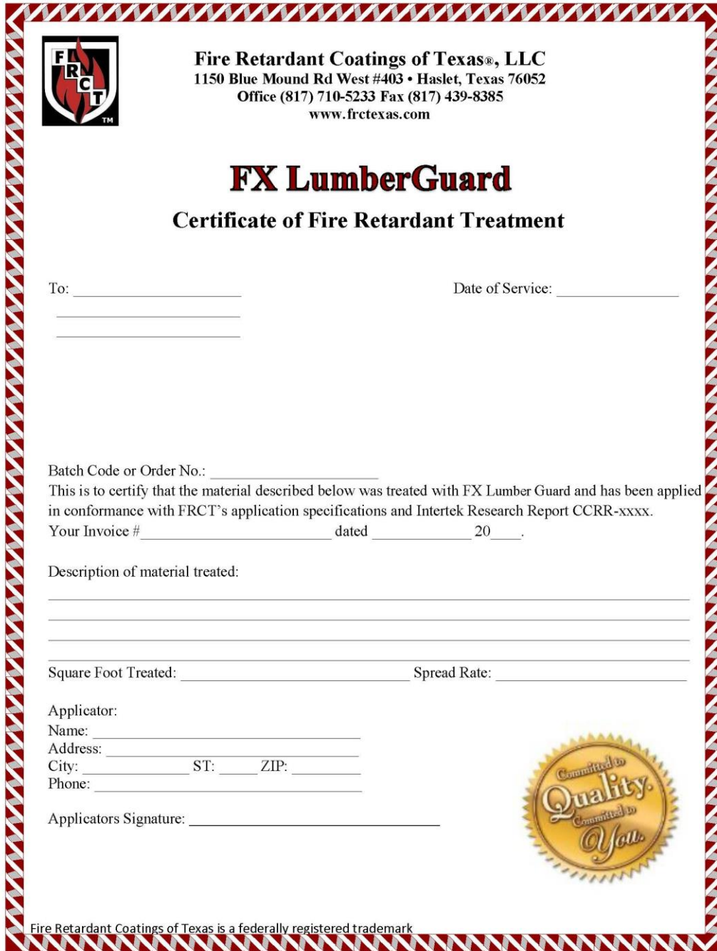
Figure 1 – Example of Certificate of Treatment (field application)