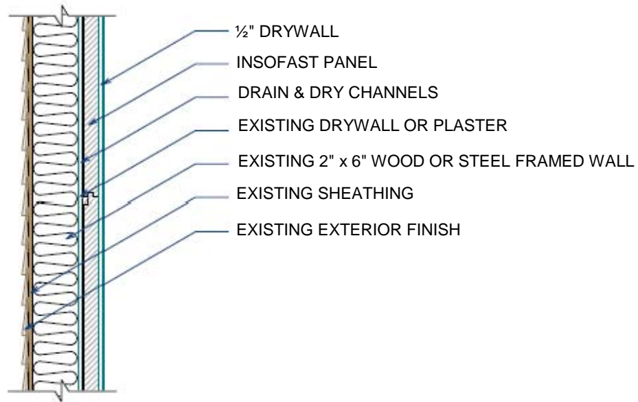
FIGURE 2 – Typical Interior Installation