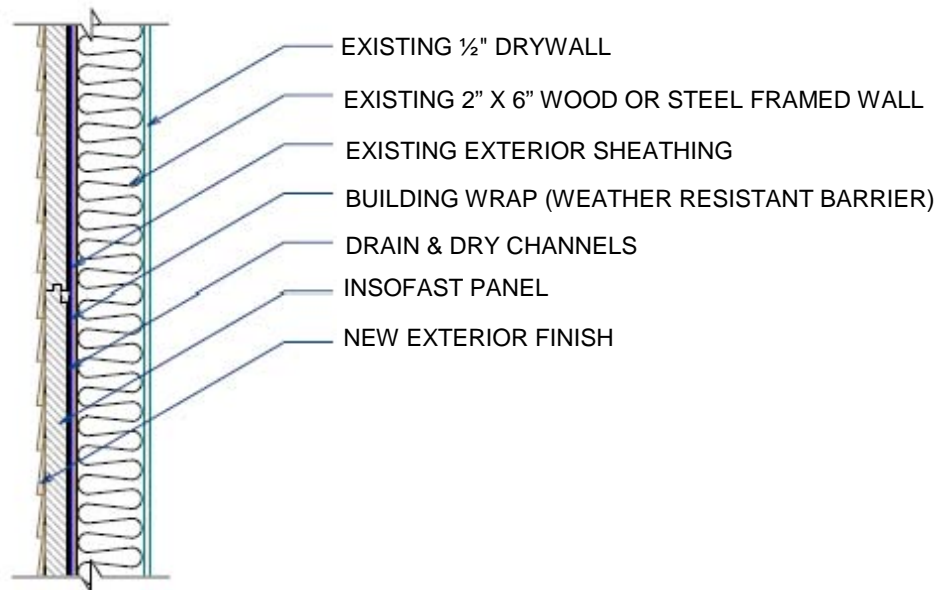
FIGURE 3 – Typical Exterior Installation